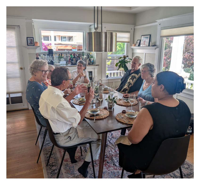
SIP & CREATE WORKSHOP Dinner Party

Last month's Sip & Create Workshop was another exciting evening of creativity and connection, as well as a culinary delight! Guests were treated to an elegant five-course meal paired with curated wines. The evening brought together neighbors and friends for a beautifully delicious experience in support of TAGS!