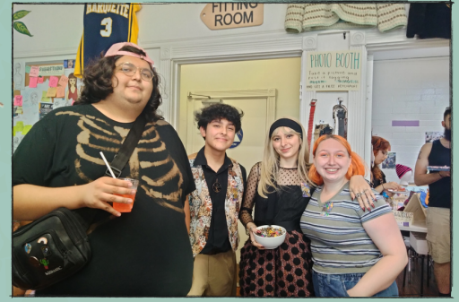
TAGS art show!